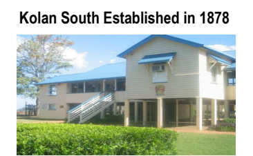
Kolan South Established in 1878

2297 Gin Gin Road, South Kolan Qld 4670 Phone: (07) 41 577361 Fax: (07) 41 577289 E-mail: admin@kolasoutss.eq.edu.au Website: www.kolasoutss.eq.edu.au