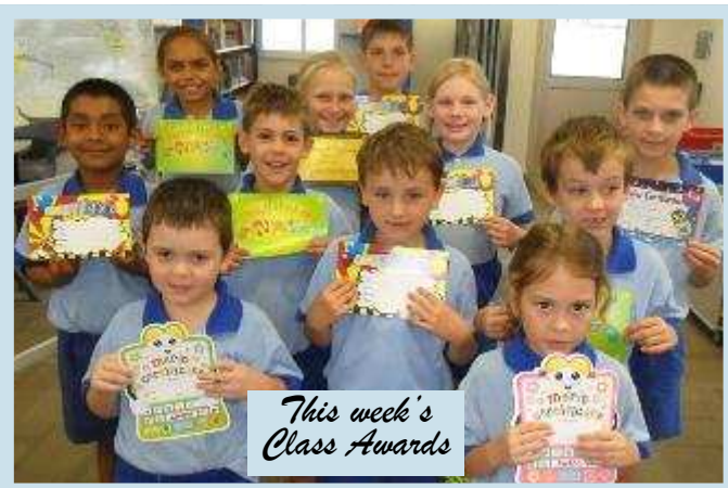
This week's Class Awards

Hmmm, I think I know what's going to happen..