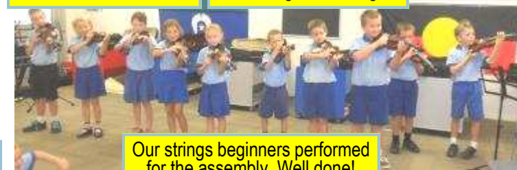
Our strings beginners performed for the assembly. Well done!