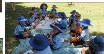
Preps had a great time at their teddy bears' picnic held recently.