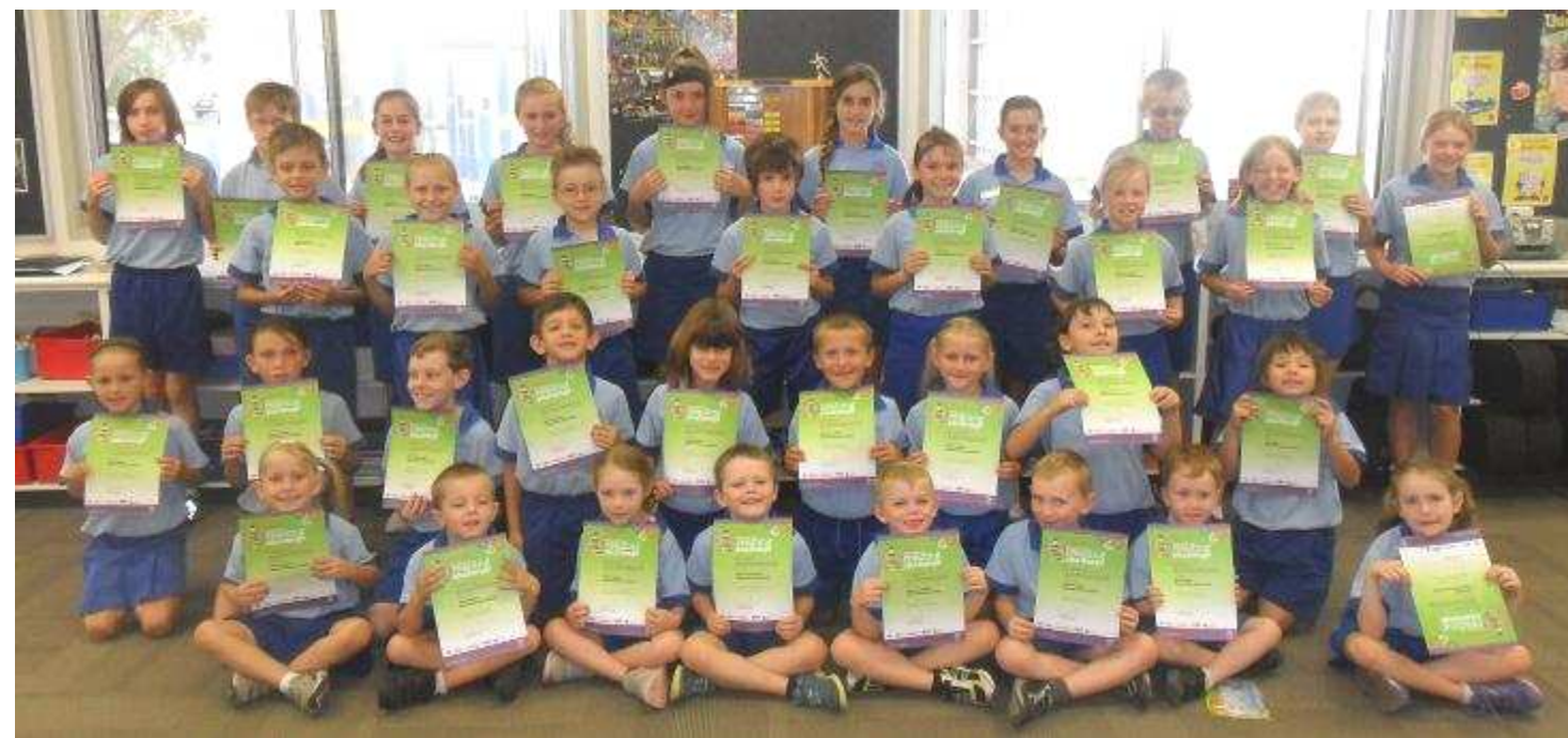
Congratulations to students who participated in this year's Premier's Reading Challenge. Thanks to families for your support.