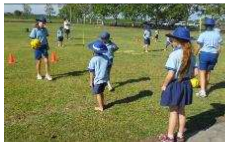
After school soccer students do some target-shooting drills.