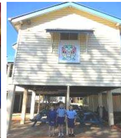
We are at Kolan South. We are in Australia.