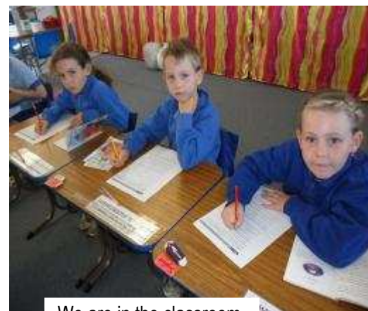
We are in the classroom. We are in Queensland.

Where are We? In this semester, YEAR 2/3 are learning about mapping and where we fit in the world. We are looking forward to drawing plans and maps of the school, our homes and even a treasure map.