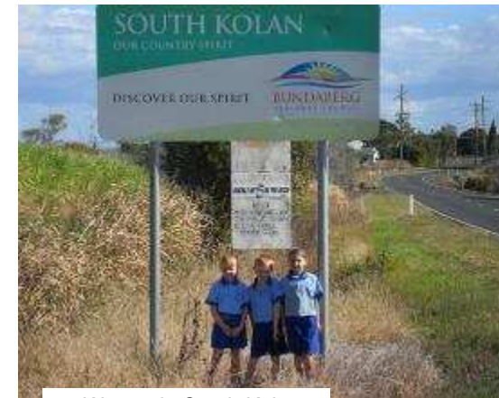
We are in South Kolan. We are in the World.