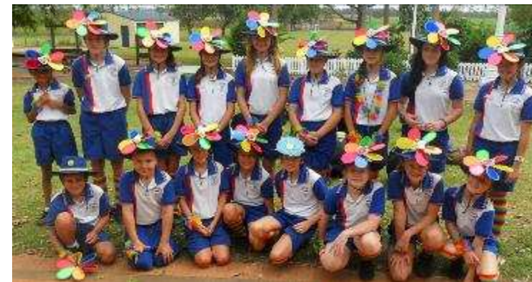
The Corps of Drums were looking colourful before their trip to Bundaberg for Bundy Crush at the Moncrieff Theatre.

Students, make sure you show your appreciation to your grandparents, this weekend, on Grandparents Day.